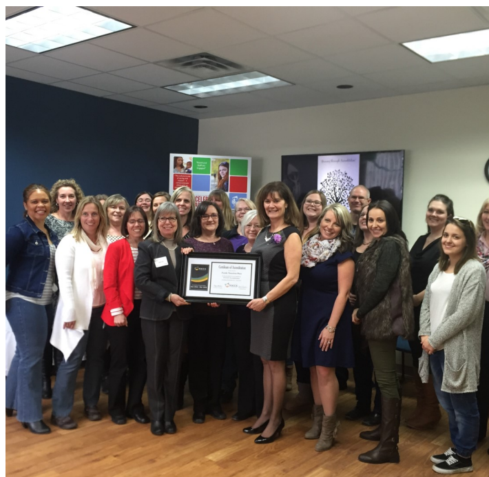
Family Transition Place receives their first Accreditation!