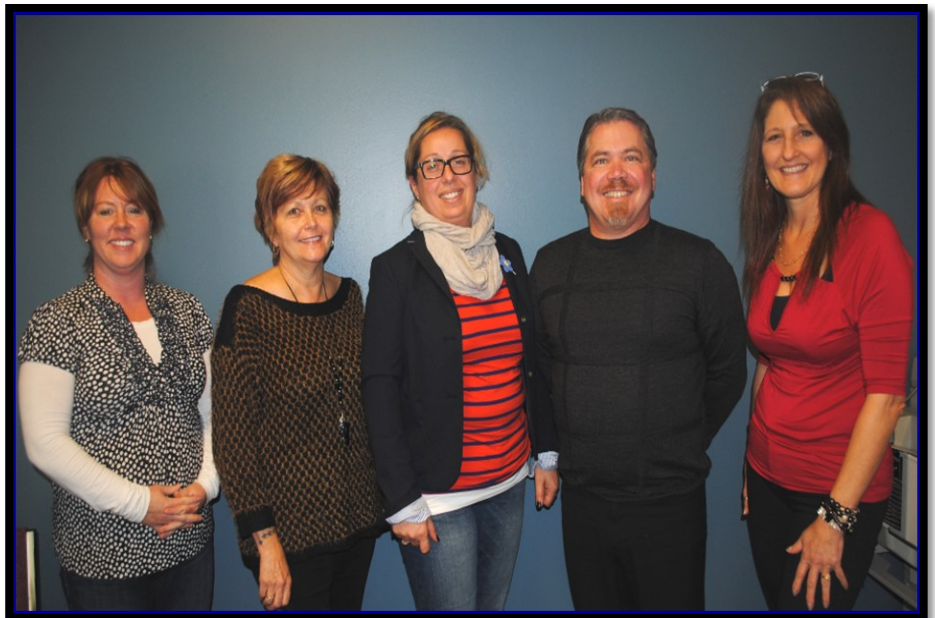
Accreditation Team for Community Living Fort Erie

"The whole process is very much a positive process and resulted for us in improved service to clients as well as demonstrating to the clients and community how much we care about doing the best work that we can for our clients and community."