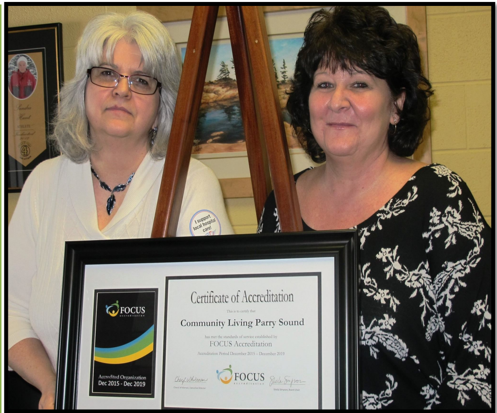
Community Living Parry Sound receives their first Accreditation—December 2015

"Staff were very involved in the preparation which resulted in a broader understanding of the whole organization for each of them."