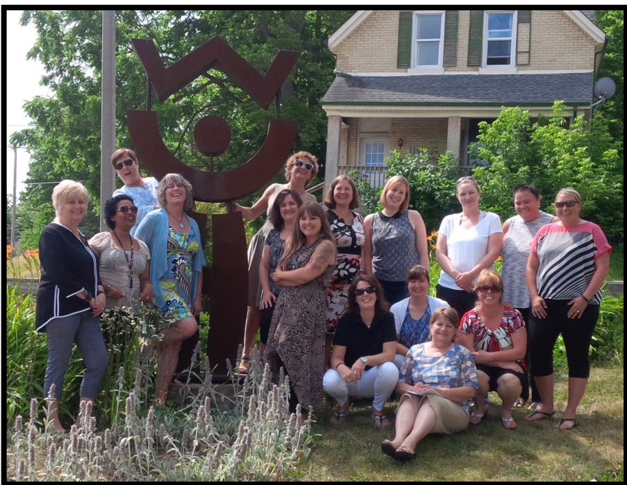
Women's Community House & FOCUS Accreditation Team