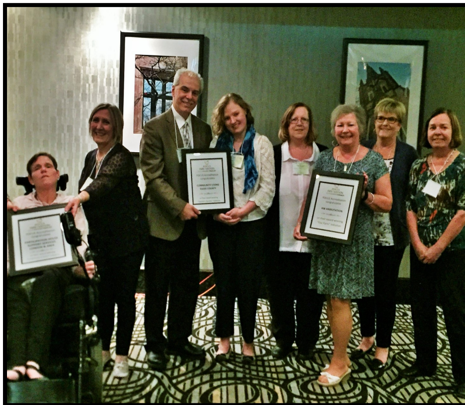
Winners from the 2016 Innovation Awards

"Conducted professionally with enthusiasm!"