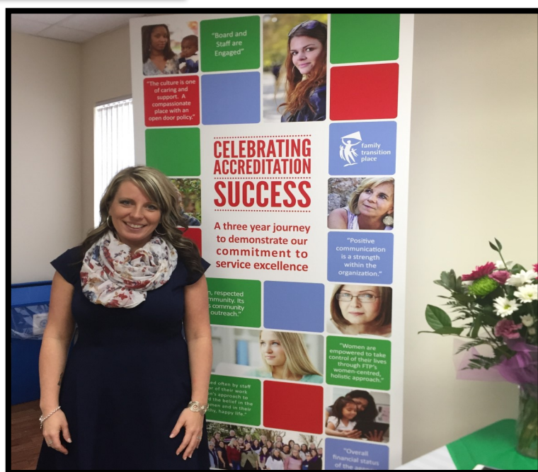
Family Transition Place, VAW—First organization to receive 100%